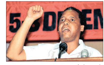
CRITICAL OF LEADERSHIP: Chris Hani in December 1991.

Yesterday, Mantashe insisted that the party would not "succumb" to the opposition's call for Zuma to fall because "we can't follow the programme of the opposition forces. It's unheard of that ANC MPs would vote for that impeachment (of Zuma in Parliament last week), it will not happen. The ANC must process these things and take its own decisions," he said, speak-